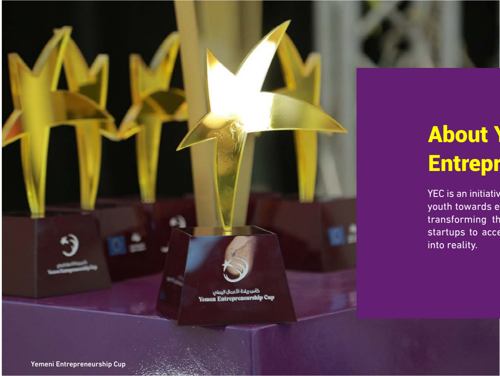
Yemeni Entrepreneurship Cup